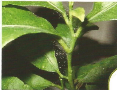
Spider Mites on a Lemon plant

Protect your plants by applying foliar sprays of Neem Pro 100% every 2 to 6 weeks (depending on pest pressure). To combat an existing infestation, do follow-up sprays (5 to 7 days) if needed.